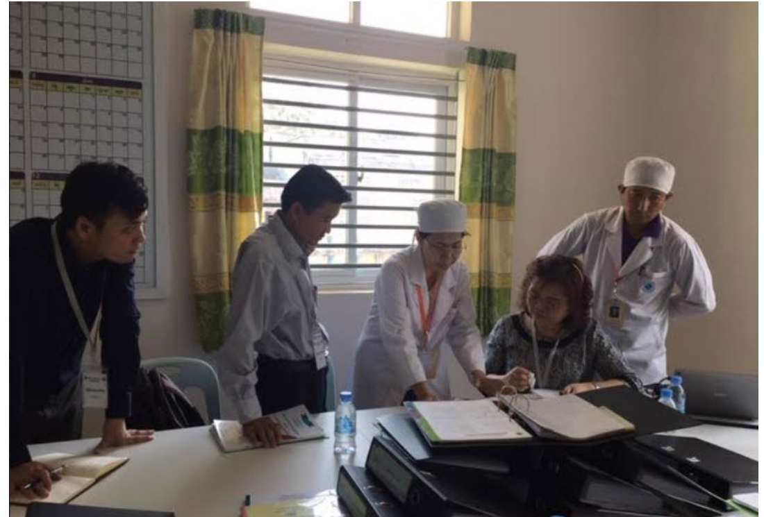
Final External Audit