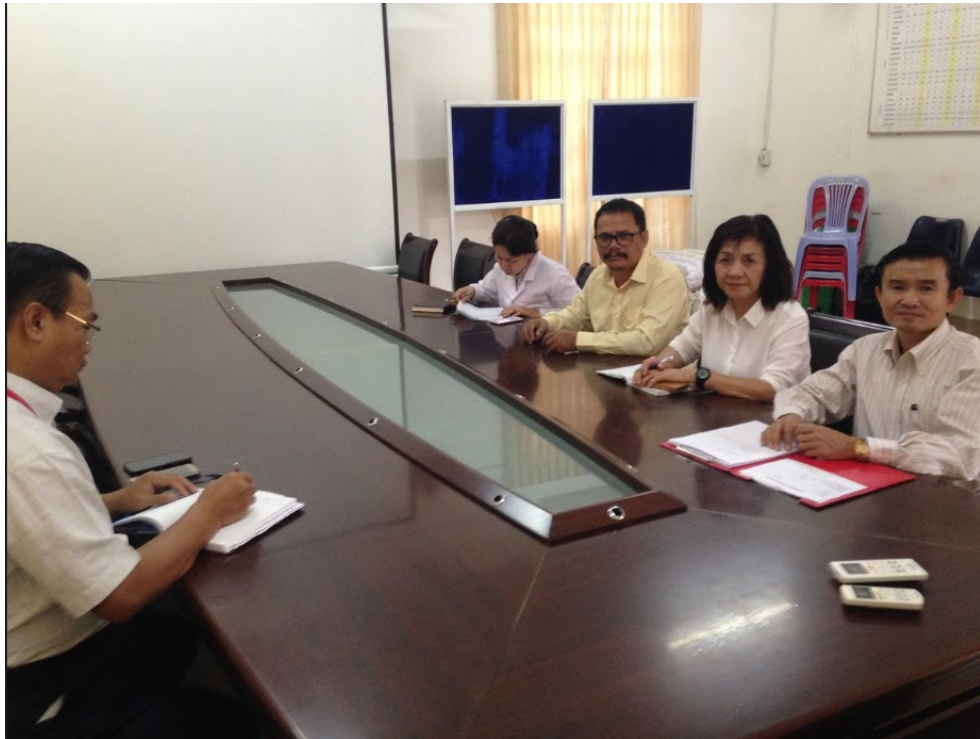
Baseline External Audit