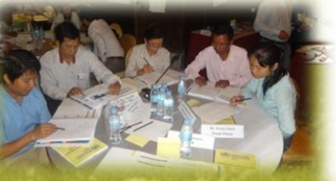
Participants were eager for learning