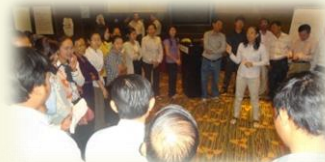
Review by "cabbage ball" game