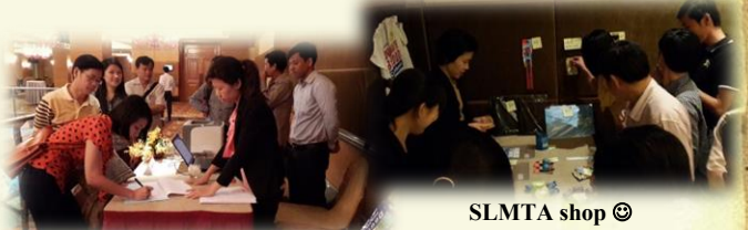
SLMTA shop ☺