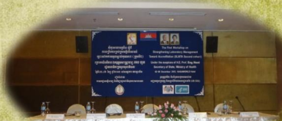
Set-up classroom, the day before the workshop