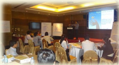
Trainer introduced overview of SLMTA program