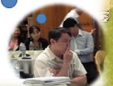
Participant was thinking of IPs assignment