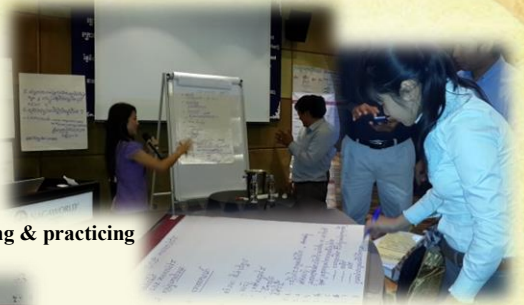
SOP writing & practicing

SLMTA program overview and process were provided to participants including Cambodia experiences from SLMTA cohort 1. Many new management tools were introduced and guided in this first workshop focusing on quality improvement methods, productivity, and SOP writing ; most participants adapted it quickly because the trainers were dedicated and enthusiasm with their teaching activities. Good teamwork among trainers made the workshop run smoothly; the trainers also continuously improved their teaching skill and knowledge based on daily evaluation from participants and feedbacks from the team at the end of each day.