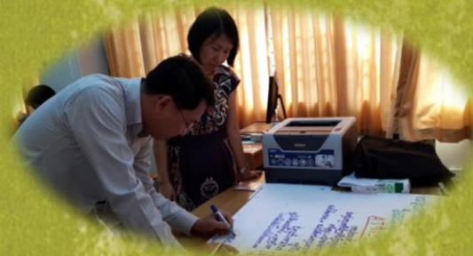
A lot of flipcharts need to be prepared as SLTMA style