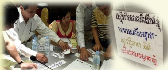
Participants were playing puzzles to find key message