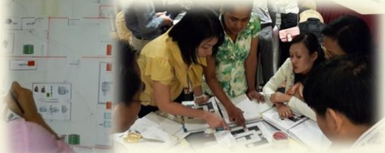
Mapping out & redesigning the floor plan