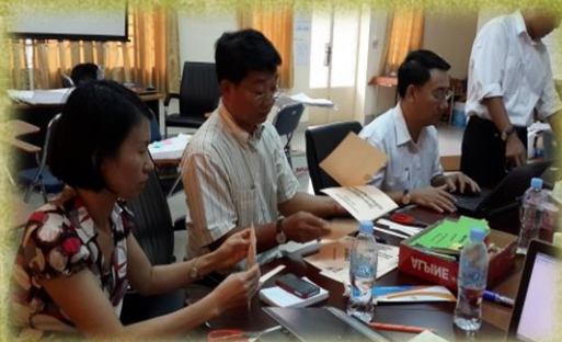
Everyone committed with their assignments