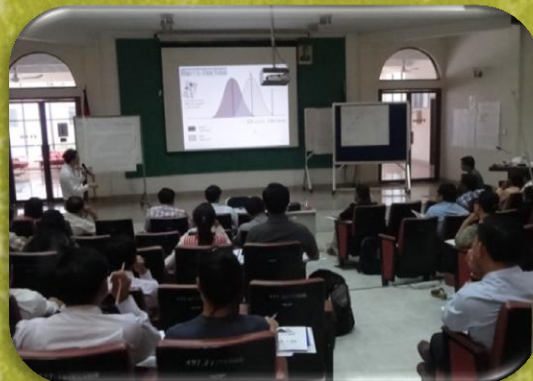
Prof. Voeung Vireask provided a lecture during the QC training workshop

Every day facilitators discussed and reviewed what have been done and plan to improve for the following days.