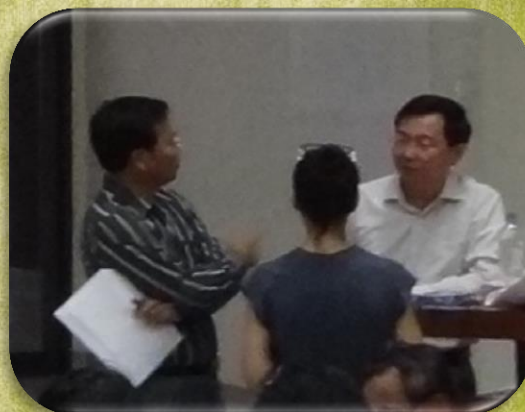
Facilitators discussed and responded for critical questions