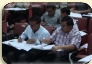
Participants were divided into a pair for group discussion